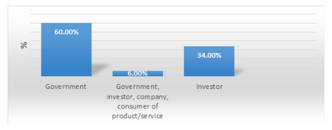
Figure 2. Parties for whom the Implementation of IFRS for SMEs in Georgia May Be Useful

think that the government will have more benefits from the adoption of IFRS for SMEs. These benefits may be better control of small and medium-sized entities; increasing the economy of the country, by supporting SMEs to make business relations global; foreign investors gain as the IFRS for SMEs make the financial condition of companies more transparent. Although, according to SMEs under the study these opportunities cannot outweigh the difficulties they face through the adoption (see Figure 2).