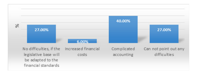
Figure 3. Challenges Faced by SMEs in Georgia through the Implementation of IFRS for SMEs

The next question was aimed at detecting the problems, which small and medium-sized entities expect from the implementation of IFRS for SMEs in Georgia. 27% of SME representatives, under the study, marked out that there will be no difficulties, if the legislative base is maximally adapted to the standards. 6% of respondents pointed out that the financial costs will be increased. 40% think that accounting will be much more complicated. 27% cannot indicate any difficulties, because the standards have not been in practice yet. Almost half of the questioned SMEs pointed out that the new standards will just complicate the accounting and the employees will need support such as trainings and consultancies, to adopt the standards in practice (see Figure 3).