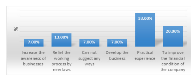
Figure 5. Ways Suggested by Respondent SMEs to Resolve Problems

Respondents suggested some ways to overcome the difficulties as well. 7% of respondent SMEs suggest that the best way to meet the challenges is to increase the awareness of businesses. 13% suggest that the government should pass the law, to simplify the working process for the companies. 13% of the companies think that the standards should be tightly related to the practice. 7% cannot suggest any ways to overcome the difficulties. 7% thinks, that the solution is to develop the business. 33%suggest that the practical experience is very important and 20 % thinks that the financial condition of the companies should be improved. The majority of SME respondents confirmed that they need more practical experience to adopt the standards easily. Quality and comparability comes along with the application of IFRS for SMEs, but the professionalism of accounting personnel, who prepare financial statements, is also very important (see Figure 5).