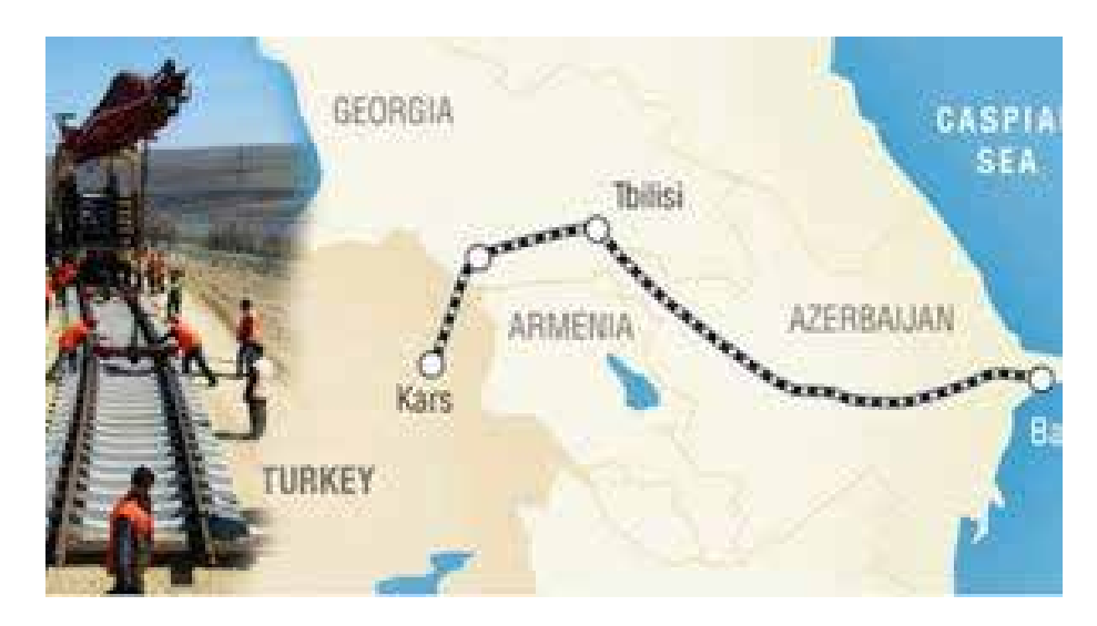
Picture 2. The Baku-Tbilisi-Kars Railway is a Bridge between Europe and Asia

In addition to the issue of cargo handling within the project, there are significant expectations regarding passenger movement as well. Experts consider that at the initial stage of the railway operation (after solving the coronavirus problem), it is estimated that about 1 million passengers will be transported. For this purpose, the Azerbaijani government already has an agreement with the Swiss company "Stadler" for the production of passenger wagons. In the long run, the number of passengers per year could reach three million people.