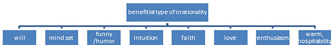
Figure 2. Irrationality.

But what kind of factors can be meant as irrational in country or national, even in personal marketing and branding? These following factors that cannot be measured by achievement oriented indicators such as: will, mindset, humor, intuition, faith, attitude and beliefs, enthusiasm, attractiveness, even beauty, which by the way cannot be measured and hospitality, warmness and helpfulness of the people.